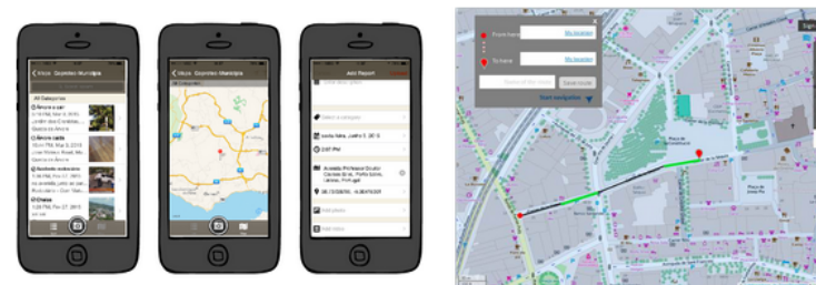
Oeiras and Girona Pilot applications mock-ups

Currently, Pilot's client applications are under deployment and focus is on on the seamless integration of the Hub services. During the next months, Pilots will be thoroughly tested and validated prior to become operational right after summer 2016.